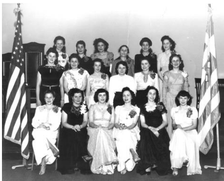
Daughters of Penelope, 1949