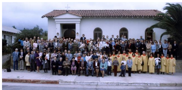
1985 Parish photo in front of first church on Castillo Street