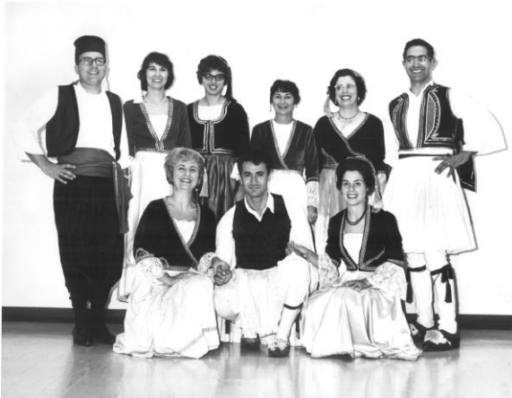
Greek folk dancers in 1962 Greek Festival

What started by the members of AHEPA in Ventura in 1956 as a BBQ fundraiser for the church, soon moved to Santa Barbara in 1959 and the newly built Earl Warren Showgrounds Exhibit Hall where a fall event called the Greek Festival took place on a Saturday night, hosting a steak dinner, Greek pasta and baklava for dessert, and an evening of folk dancing. The proceeds from this