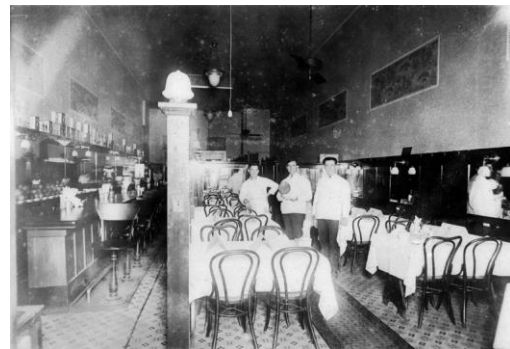
Splendid Café at 623 State St. circa 1922

By the end of 1919 a definite pattern in Greek ownership was taking shape: the family restaurant. It was the restaurant business that supplied the largest source of employment for Greek men. Waiters, short-order cooks, and eventually proprietors of these cafes shaped the personality of the fledgling