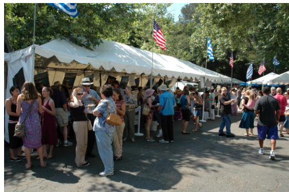
Festival Crowd at Oak Park

Decades later, the Annual Greek Festival is still held at Oak Park and is crowned as the oldest and repeatedly voted the best ethnic festival in the county. Thanks, Helen!