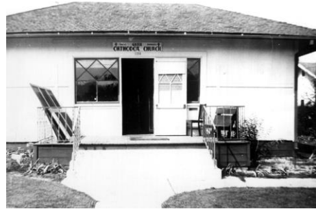
First building used as a Church sanctuary

In 1946 several Greek businessmen pooled their financial resources to purchase a parcel of land housing a vacant elementary school building at 1124 Castillo Street. The interior was transformed into an Orthodox sanctuary and a place of worship for the Greek community, which now included wives, mothers and children. Some of the families who settled in Santa Barbara