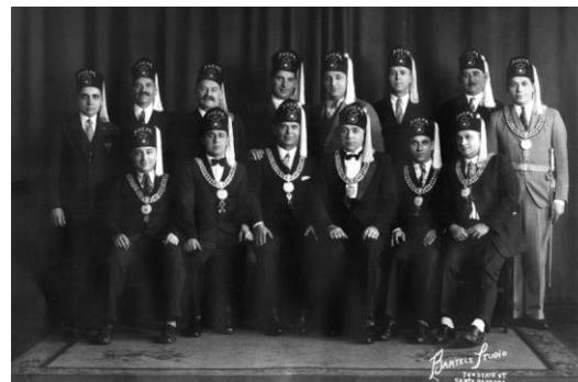
Santa Barbara AHEPA Chapter, 1929